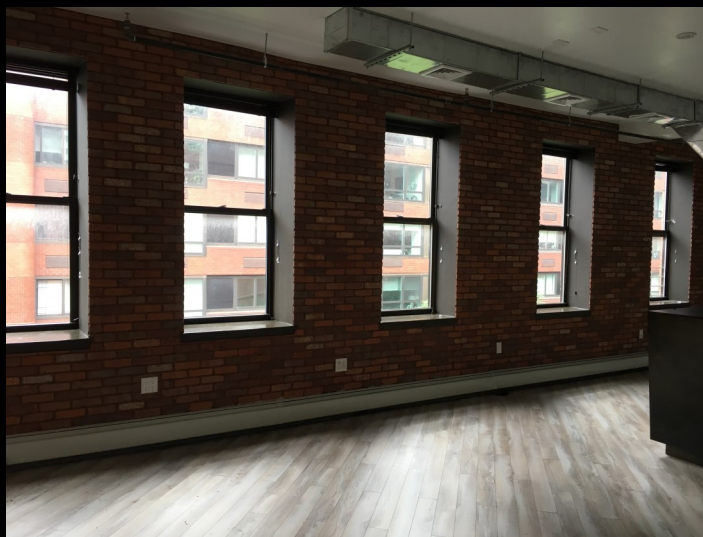
Front Facing Windows