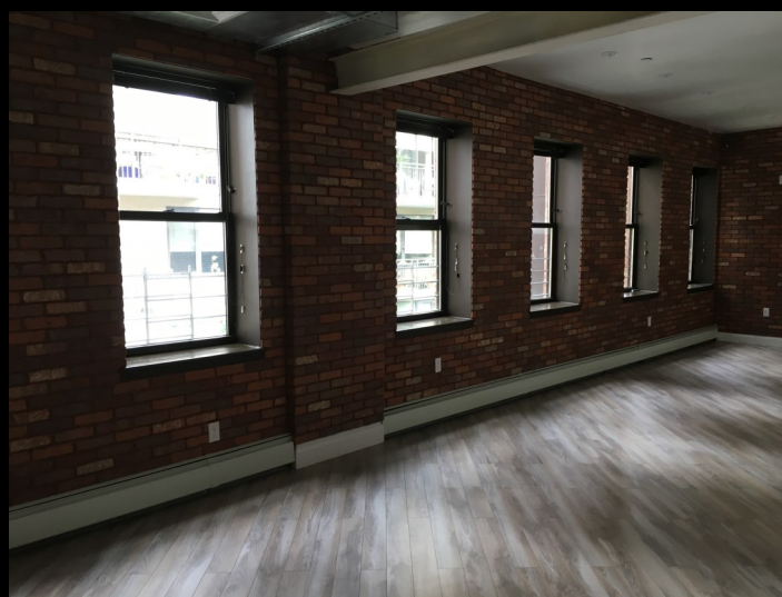
Rear Facing Windows