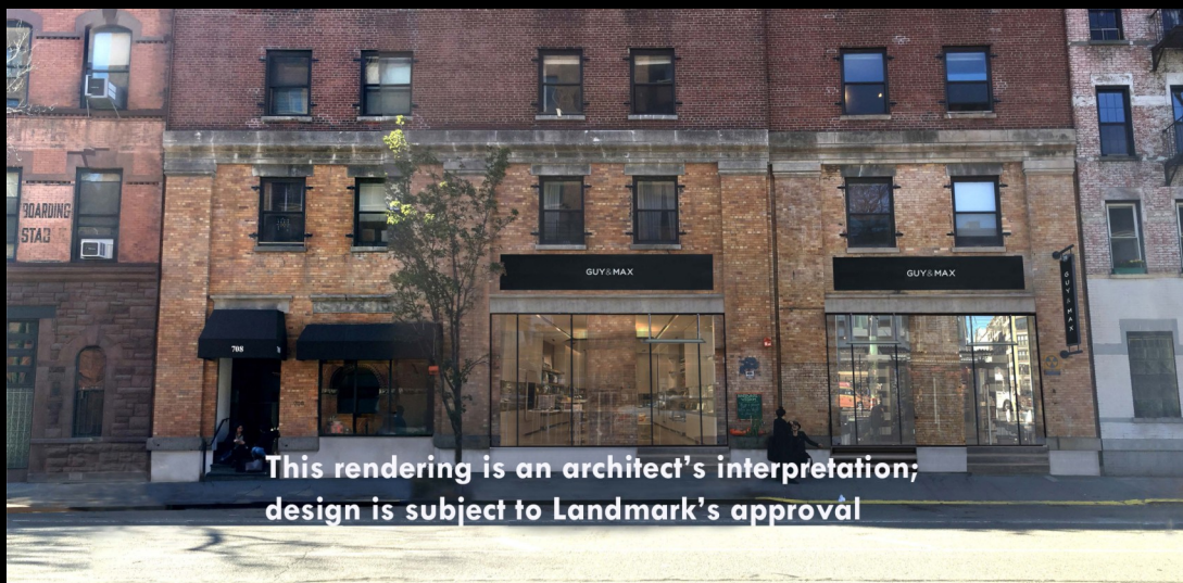
This rendering is an architect's interpretation; design is subject to Landmark's approval